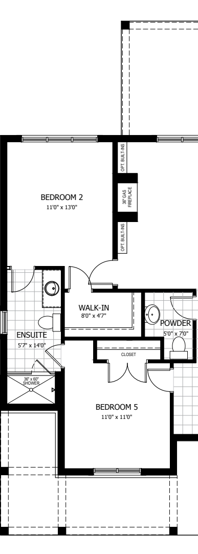
MAIN FLOOR 5 BEDROOM OPTION 2,354 sq. ft.